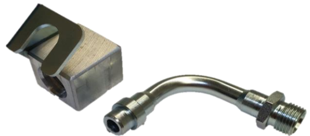
Adapter 400.471.000 Anschluss zwischen Ölkühlerleitung und Getriebe Connection between oil cooler line and transmission