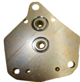
Adapter 400.479.000 Anschluss anstelle des Ölkühlers Connection instead of oil cooler