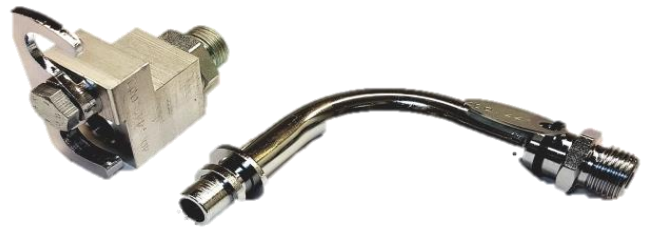
Adapter 400.441.000 ***

Anschluss zwischen Ölkühlerleitung und Getriebe oder an den Ölkühler Connection between oil cooler line and transmission