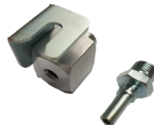
Adapter 400.467.000 Anschluss zwischen Ölkühlerleitung und Ölkühler Connection between oil cooler line and oil cooler