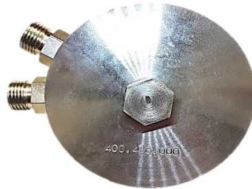
Adapter 400.436.000 *** Anschluss anstelle des Ölkühlers Connection instead of oil cooler