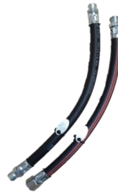
Adapter 400.465.000 Anschluss zwischen Ölkühlerleitung und Getriebe Connection between oil cooler line and transmission