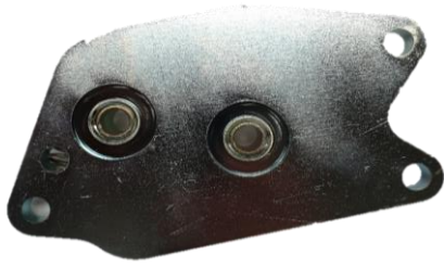
Adapter 400.468.000 Anschluss anstelle des Ölkühlers