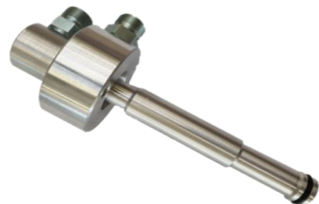
Adapter 400.473.000 Anschluss anstelle des Ölkühlers Connection instead of oil cooler

Ölwechsel und Ölstandkontrolle immer auch am manuellen Kreislauf! Oil change and oil level check always also on the manual circuit!