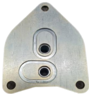
Adapter 400.476.000 Anschluss anstelle des Ölkühlers Connection instead of oil cooler