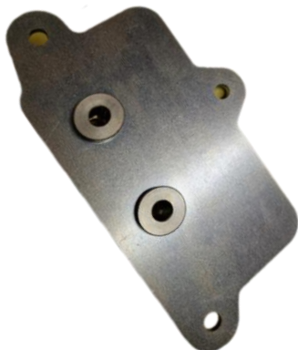
Adapter 400.478.000 Anschluss anstelle des Ölkühlers Connection instead of oil cooler