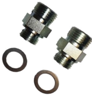
Adapter 400.464.000 Anschluss am Getriebe, anstelle der Blindstopfen Connection to gear unit, instead of blind plugs