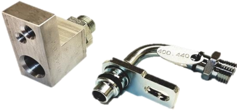
Adapter 400.440.000 ***

Anschluss zwischen Ölkühlerleitung und Getriebe oder an den Ölkühler Connection between oil cooler line and transmission