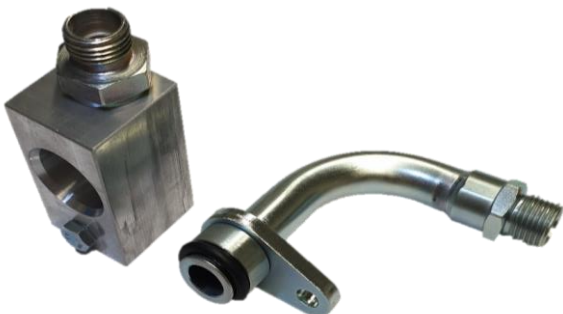
Adapter 400.472.000 Anschluss zwischen Ölkühlerleitung und Getriebe Connection between oil cooler line and transmission