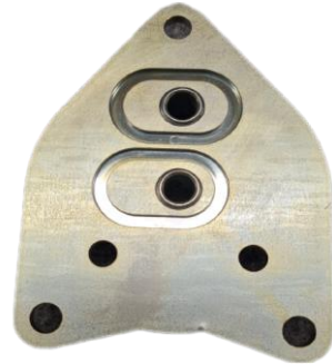
Adapter 400.475.000 Anschluss anstelle des Ölkühlers Connection instead of oil cooler