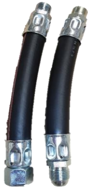
Adapter 400.462.000 Anschluss in die Ölkühlerleitung Connection to the oil cooler line