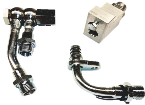
Adapter 400.433.000 *** Anschluss zwischen Ölkühlerleitung und Getriebe Connection between oil cooler line and transmission