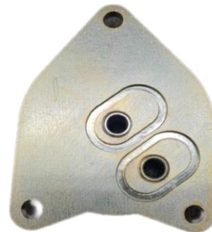
Adapter 400.477.000 Anschluss anstelle des Ölkühlers Connection instead of oil cooler