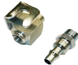
Adapter 400.452.000 ***

Anschluss anstelle des Ölfilters Connection instead of oil filter