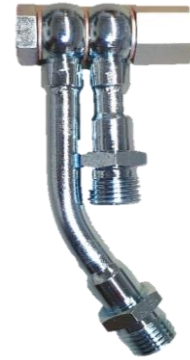
Adapter 400.463.000 Anschluss zwischen Ölkühlerleitung und Getriebe Connection between oil cooler line and transmission