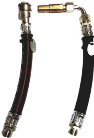
Adapter 400.435.000 *** Anschluss zwischen Ölkühlerleitung und Ölkühler Connection between oil cooler line and oil cooler