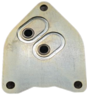
Adapter 400.474.000 Anschluss anstelle des Ölkühlers Connection instead of oil cooler