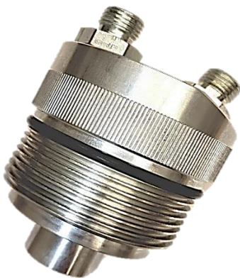
Adapter 400.444.000 ***

Anschluss zwischen Ölkühlerleitung und Getriebe Connection between oil cooler line and transmission