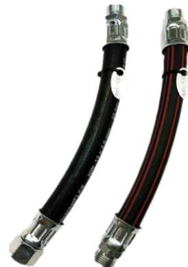
Adapter 400.438.000 *** Anschluss in die Ölkühlerleitung Connection in the oil cooler line