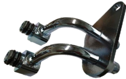
Adapter 400.469.000 Anschluss anstelle des Ölkühlers