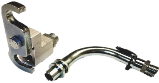
Adapter 400.442.000 ***

Anschluss zwischen Ölkühlerleitung und Getriebe Connection between oil cooler line and transmission