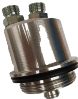
Adapter 400.466.000 Anschluss anstelle des Ölfilters Connection instead of oil filter