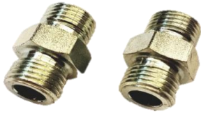
Adapter 400.431.000 Anschluss am Getriebe Connection to automatic transmission