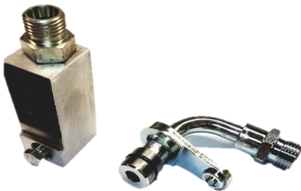
Adapter 400.437.000 *** Anschluss zwischen Ölkühlerleitung und Getriebe Connection between oil cooler line and transmission