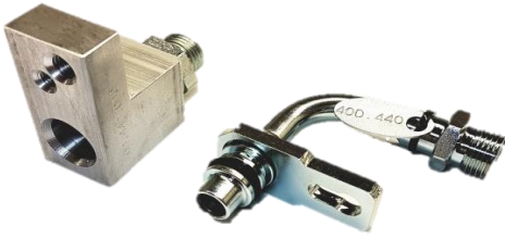
Adapter 400.440.000 ***

Anschluss zwischen Ölkühlerleitung und Getriebe oder an den Ölkühler Connection between oil cooler line and transmission