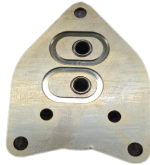
Adapter 400.475.000 Anschluss anstelle des Ölkühlers Connection instead of oil cooler