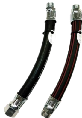
Adapter 400.438.000 *** Anschluss in die Ölkühlerleitung Connection in the oil cooler line