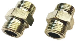
Adapter 400.431.000 Anschluss am Getriebe Connection to automatic transmission