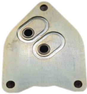
Adapter 400.474.000 Anschluss anstelle des Ölkühlers Connection instead of oil cooler