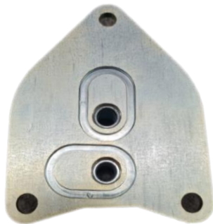
Adapter 400.476.000 Anschluss anstelle des Ölkühlers Connection instead of oil cooler