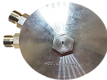
Adapter 400.436.000 *** Anschluss anstelle des Ölkühlers Connection instead of oil cooler