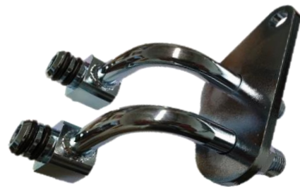
Adapter 400.469.000 Anschluss anstelle des Ölkühlers