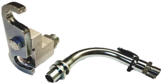
Adapter 400.442.000 ***

Anschluss zwischen Ölkühlerleitung und Getriebe Connection between oil cooler line and transmission