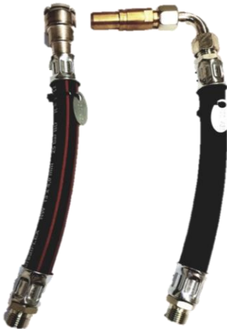
Adapter 400.435.000 *** Anschluss zwischen Ölkühlerleitung und Ölkühler Connection between oil cooler line and oil cooler