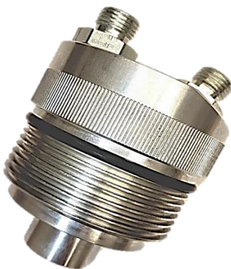
Adapter 400.444.000 ***

Anschluss zwischen Ölkühlerleitung und Getriebe Connection between oil cooler line and transmission