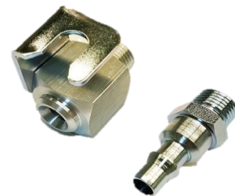
Adapter 400.452.000 ***

Anschluss anstelle des Ölfilters Connection instead of oil filter