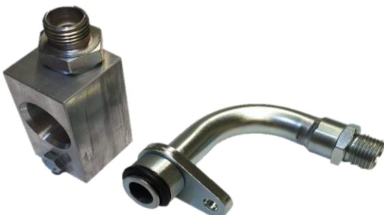
Adapter 400.472.000 Anschluss zwischen Ölkühlerleitung und Getriebe Connection between oil cooler line and transmission