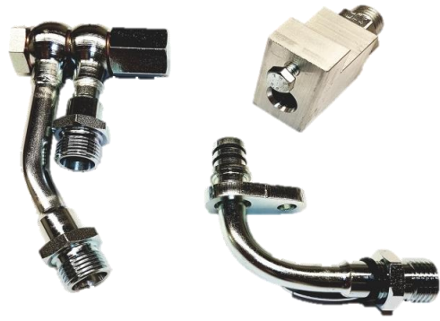
Adapter 400.433.000 *** Anschluss zwischen Ölkühlerleitung und Getriebe Connection between oil cooler line and transmission