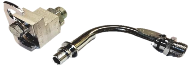
Adapter 400.441.000 ***

Anschluss zwischen Ölkühlerleitung und Getriebe oder an den Ölkühler Connection between oil cooler line and transmission