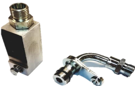
Adapter 400.437.000 *** Anschluss zwischen Ölkühlerleitung und Getriebe Connection between oil cooler line and transmission