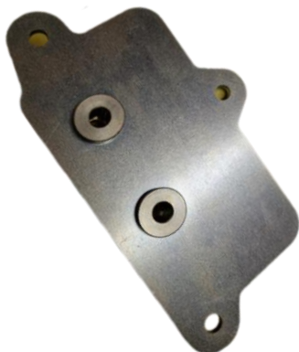
Adapter 400.478.000 Anschluss anstelle des Ölkühlers Connection instead of oil cooler