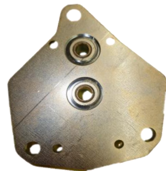
Adapter 400.479.000 Anschluss anstelle des Ölkühlers Connection instead of oil cooler