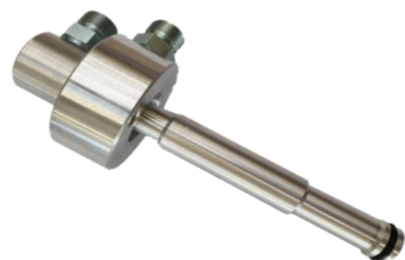
Adapter 400.473.000 Anschluss anstelle des Ölkühlers Connection instead of oil cooler

Ölwechsel und Ölstandkontrolle immer auch am manuellen Kreislauf! Oil change and oil level check always also on the manual circuit!