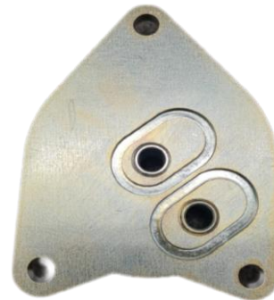
Adapter 400.477.000 Anschluss anstelle des Ölkühlers Connection instead of oil cooler