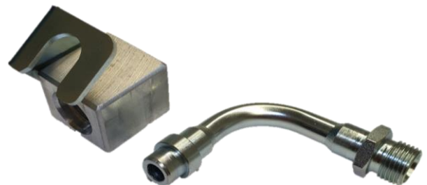
Adapter 400.471.000 Anschluss zwischen Ölkühlerleitung und Getriebe Connection between oil cooler line and transmission