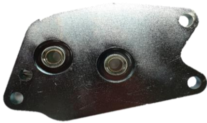
Adapter 400.468.000 Anschluss anstelle des Ölkühlers